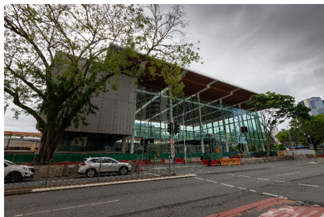
Above: Roma Street road to be resurfaced in mid-2026.

For more information, you can view the Roma Street station design fact sheet here .