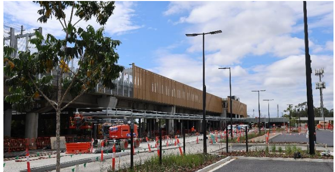
Pictured: Station and car park construction

Key construction activities to be carried out in February are outlined below.