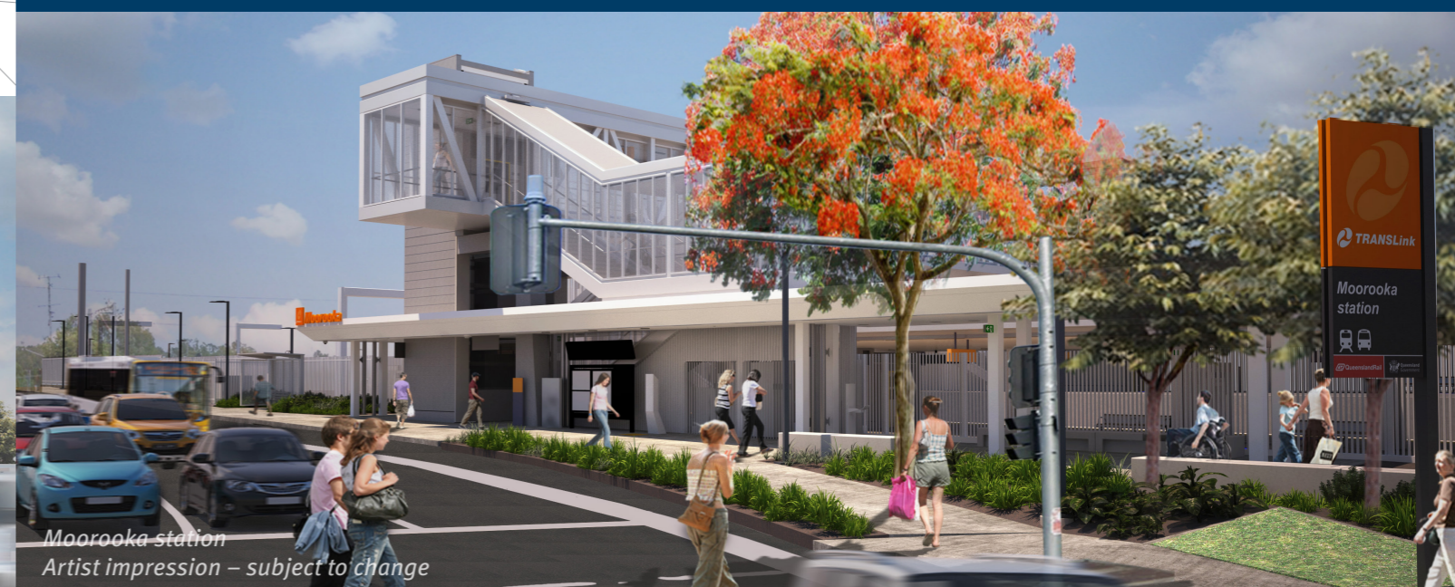
Moorooka station Artist impression – subject to change

1800 010 875 info@unityalliance.com.au crossrивerrail.qld.gov.au