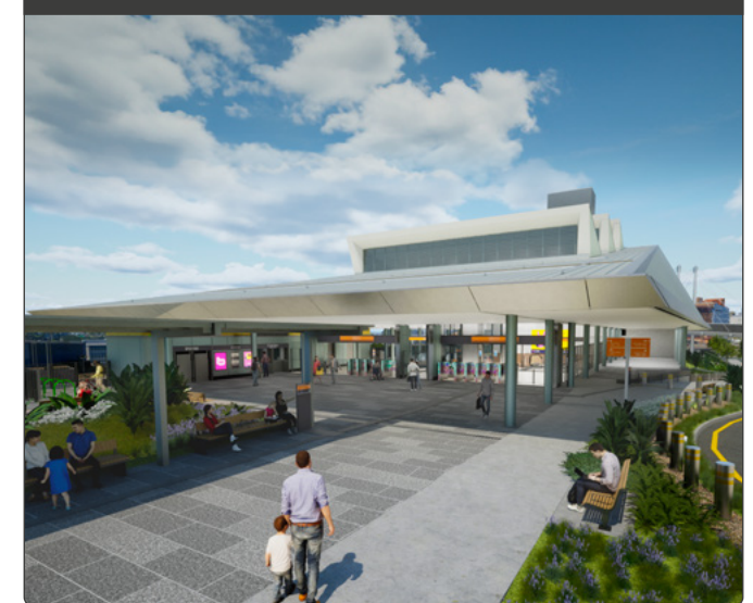
Main station entrance

From this open and generous concourse space, banks of escalators descend down to a 220-metre long mezzanine level, from which customers will access the station platform.