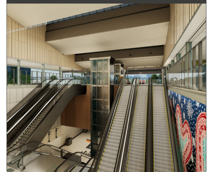
Station entry interior

All the images in this document are digital illustrations – Not final for design or build.