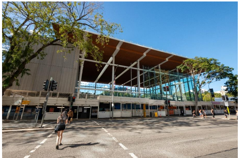
Above: View of the main station building from Roma Street.

These works may require changes to traffic conditions and pedestrian access in the area. Further information, including timing and impacts, will be provided to the community in advance of the work commencing.