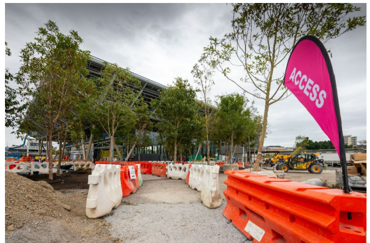
Above: Trees planted around the Woolloongabba station entrances.