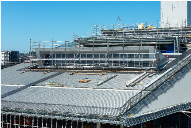
Above: Boggo Road station canopy and structural steel placement

In the Southern Area, work continues to undertake earthworks to fill in the temporary decline structure. Tunnel fit-out works are ongoing.