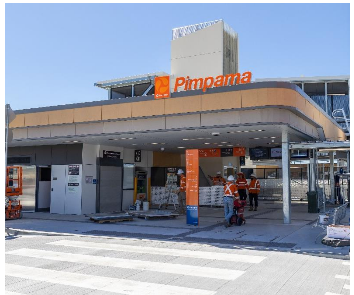
Pictured: Main station entrance