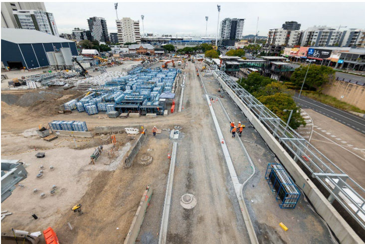
Photo: Construction of new road and footpath.

All activities are subject to approvals and weather conditions