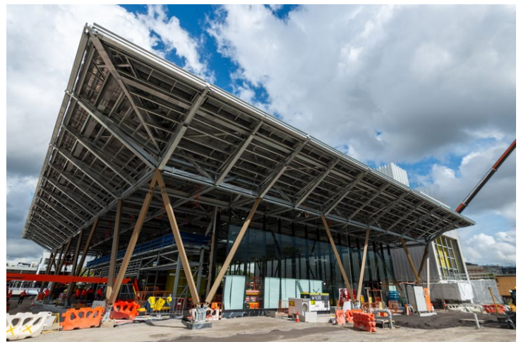
Photo: Glass panels now installed at the new Woolloongabba station

Scan to learn more about Woolloongabba station's design and new road and pathway upgrades.