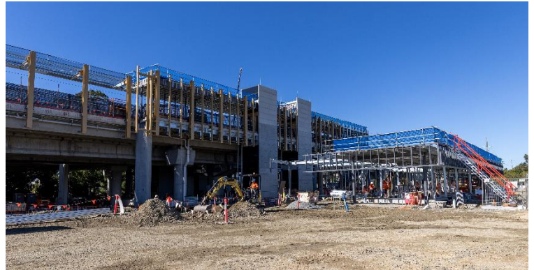
Pictured: Station building construction underway at Hope Island station

Key construction activities to be carried out in August are outlined below