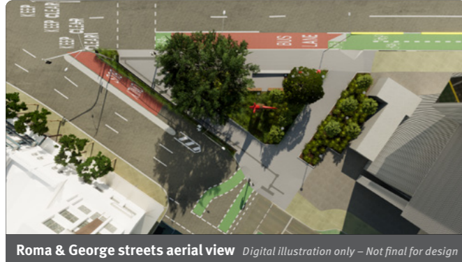
Roma & George streets aerial view Digital illustration only – Not final for design

A Request for Project Change (RfPC) is made when a project's evaluated scope, design or conditions of approval are proposed to be amended. This process, which includes public consultation and a formal submission process, allows the proposed changes to be evaluated by the Coordinator-General. If the changes are deemed acceptable by the Coordinator-General, they become part of the evaluated Project for construction.