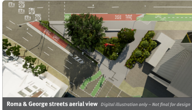
Roma & George streets aerial view Digital illustration only – Not final for design

A Request for Project Change (RfPC) is made when a project's evaluated scope, design or conditions of approval are proposed to be amended. This process, which includes public consultation and a formal submission process, allows the proposed changes to be evaluated by the Coordinator-General. If the changes are deemed acceptable by the Coordinator-General, they become part of the evaluated Project for construction.