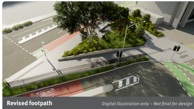
Revised footpath Digital illustration only – Not final for design