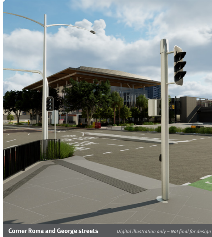
Corner Roma and George streets Digital illustration only – Not final for design