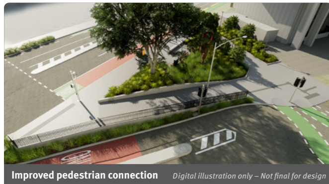
Improved pedestrian connection Digital illustration only – Not final for design