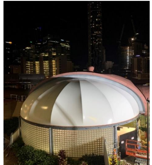
Complete architectural dome

Works are scheduled to occur between 6:30am and 6:30pm, Monday to Sunday, construction conditions permitting.