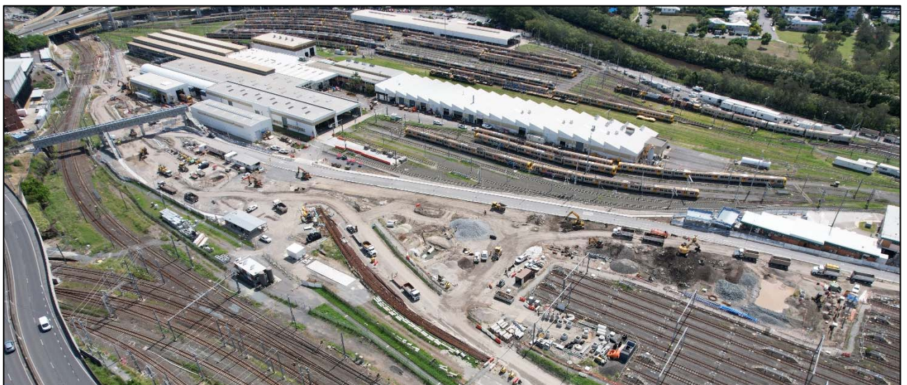
February 2024 – Earthworks and drainage Mayne Yard East.