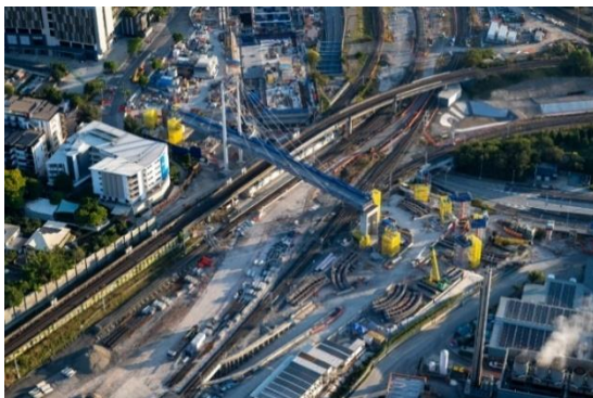
Image: Progress of the Boggo Road Station.

Additional works will occur within the rail corridor during October and November. Please register to receive updates at crossriverrail.qld.gov.au .