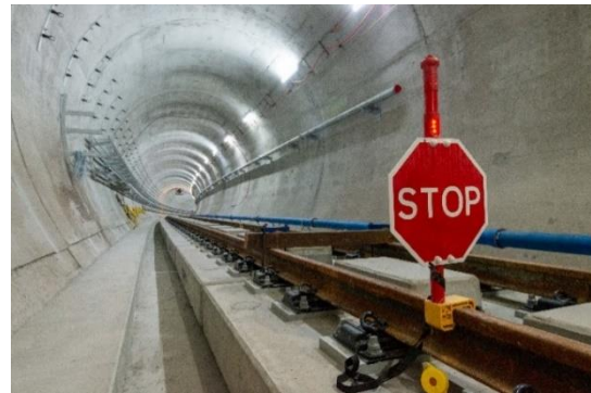
Image: View of track laid inside the tunnel