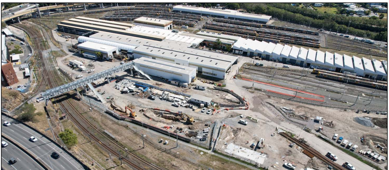
August 2023 – Mayne Yard East construction