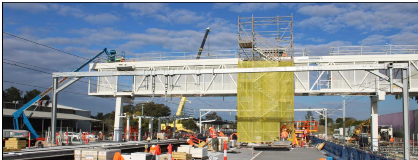
July 2023 - New Rocklea station pedestrian overpass installation