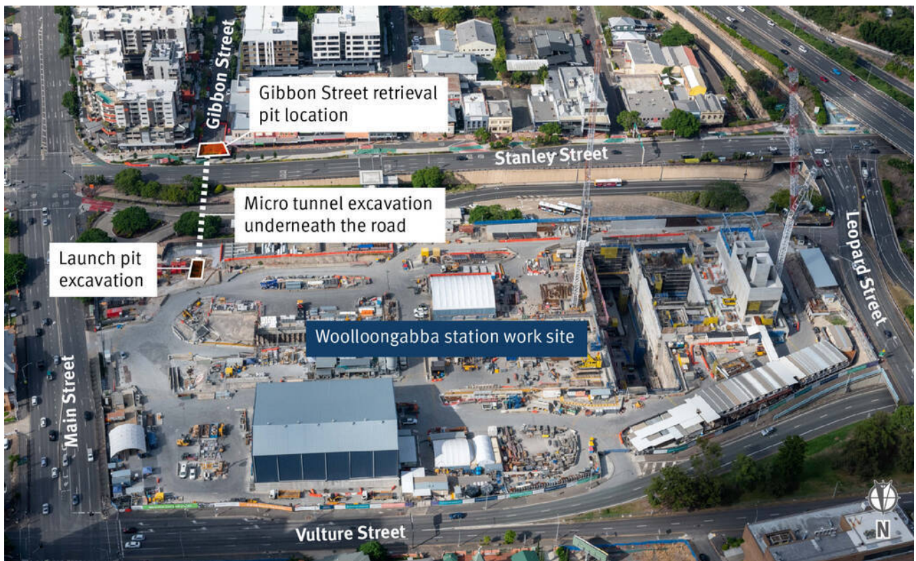
Image 3: Aerial image of Woolloongabba station work site and Gibbon Street work area.

Thank you for your patience during this time. For more information please email crossriverrail@cbgujv.com.au or call 1800 010 875.