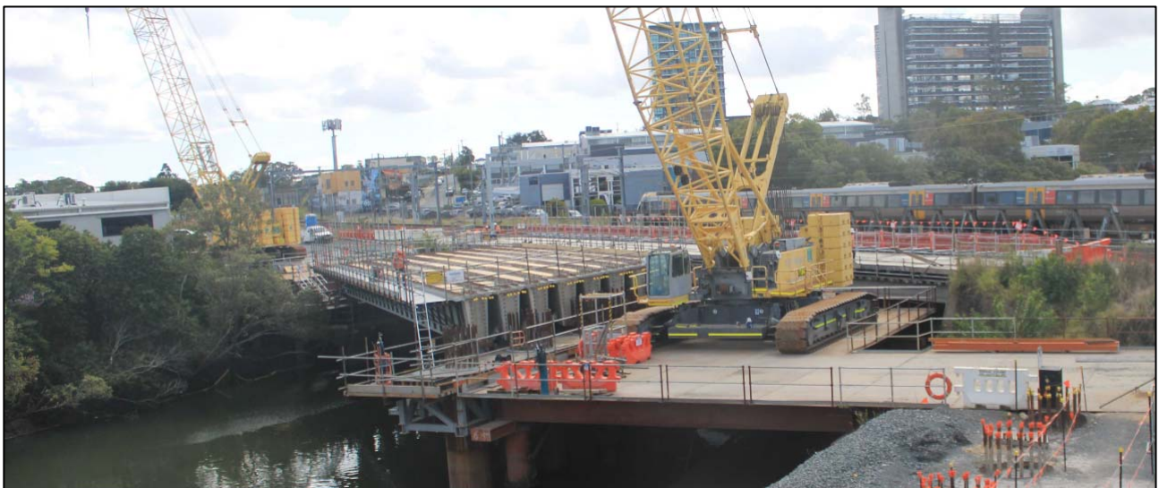
May 2023 – Breakfast Creek rail bridge girders lifted into place