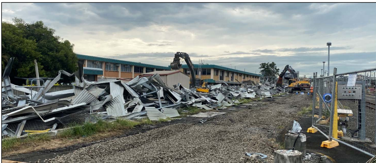
March 2023 – Decommissioning of redundant facilities within Mayne Yard East