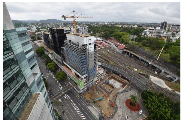
Roma Street construction site - January 2020