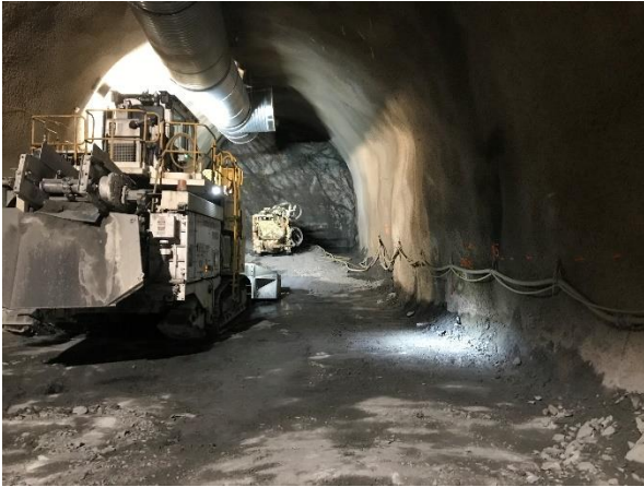
Tunnelling progress at Roma Street site

Tunnelling of the new underground station cavern continues with approximately 27 metres excavated by the roadheader, as at the middle of June.