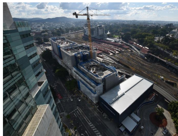
Roma Street construction site - June 2020